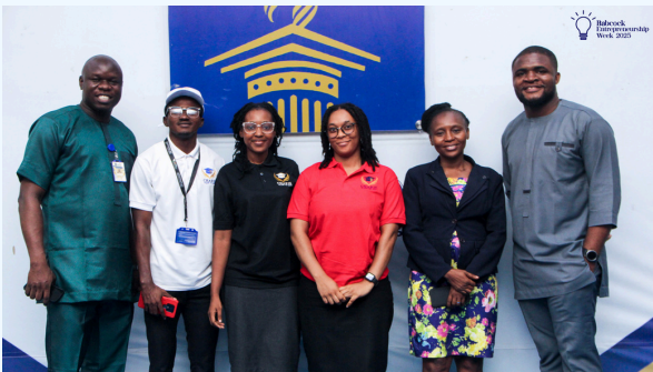
Babcock Students with BEDC Leadership at the Babcock Innovation Challenge 4.0.