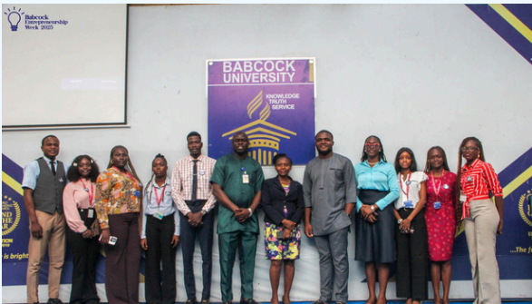
Participants at the Babcock Innovation Challenge 4.0