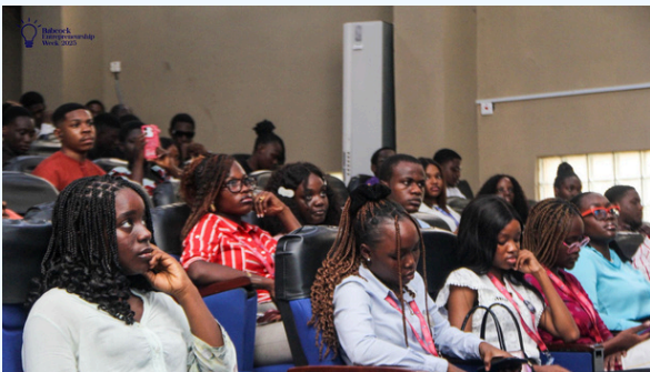
Attendees of the Babcock Innovation Challenge 4.0