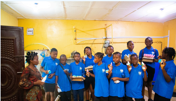
Babcock Academy Students Displaying BEDC Products