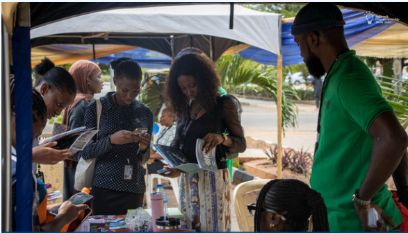
Sales exhibition by Babcock Student Entrepreneurs