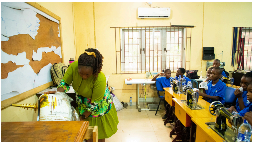
Students displayed keen interest, absorbing insights from our trainer during their immersive visit.