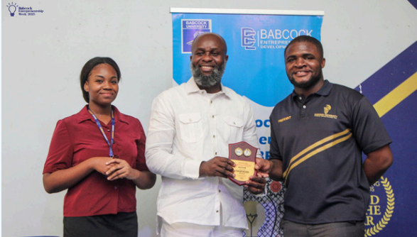
BUSEC Excos Presenting an Award to a Facilitator at the Babcock Entrepreneurship Week 4.0