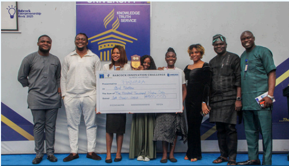
Prize winner at the Babcock Innovation Challenge 4.0