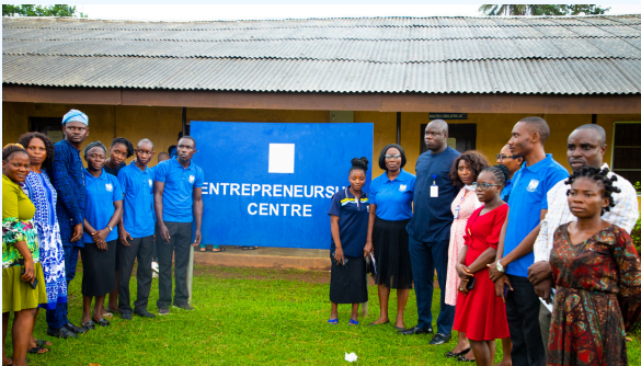
A Joint Photo of Babcock Academy Students and Staff with BEDC Leadership and Trainers