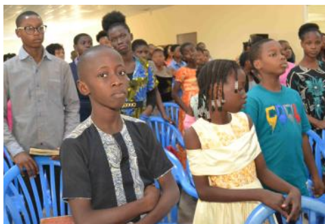
A cross section of the congregation

“Jesus fed over 5,000 with bread given by a little boy willing to share his lunch.