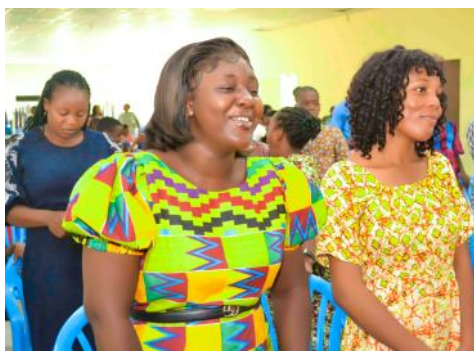
Students at the event.