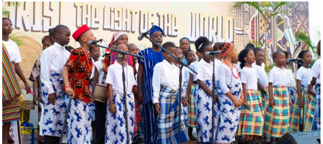
Children of the BU Staff School make their presentation at the Feast of Light.