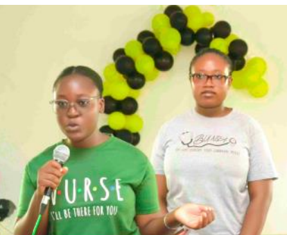
Nursing volunteers make their presentation.