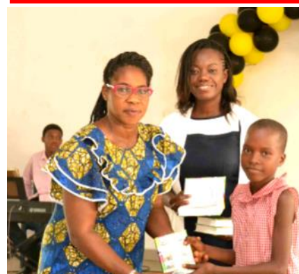
A pupil receives a copy of the Holy Bible