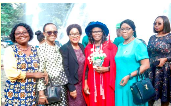
Friends and professional colleagues with the inaugural lecturer