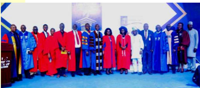
Deans and officers with inaugural lecturer