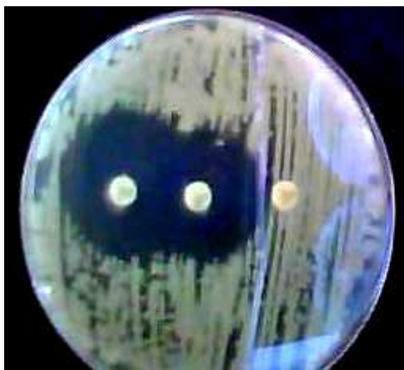
Fig. 1: E. coli showing ESBL production by DDST method. Ceftazidime (left disc), clavulanic acid (middle disc) and cefotaxime (right disc).

a Antibiotics: AMX, Amoxicillin; GEN, Gentamicin; TET, Tetracycline; COT, Cotrimoxazole; CIP, Ciprofloxacin; OFL, Ofloxacin; CEF: Ceftriaxone.; b % MDR: percentage isolates of a species showing multidrug resistance among all tested MDR enterobacteria; c % ESBL+ve: percentage multidrug resistant strains of a species producing ESBL